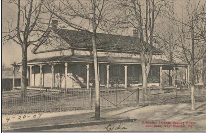
Orthodox Friends Meeting House, N. Church Street