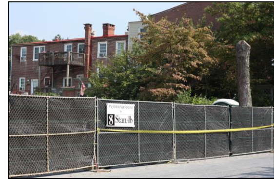
Chestnut Street: 60 Condo Units