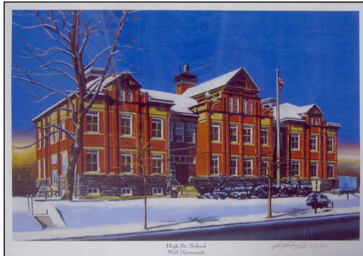
High St. School, South High Street